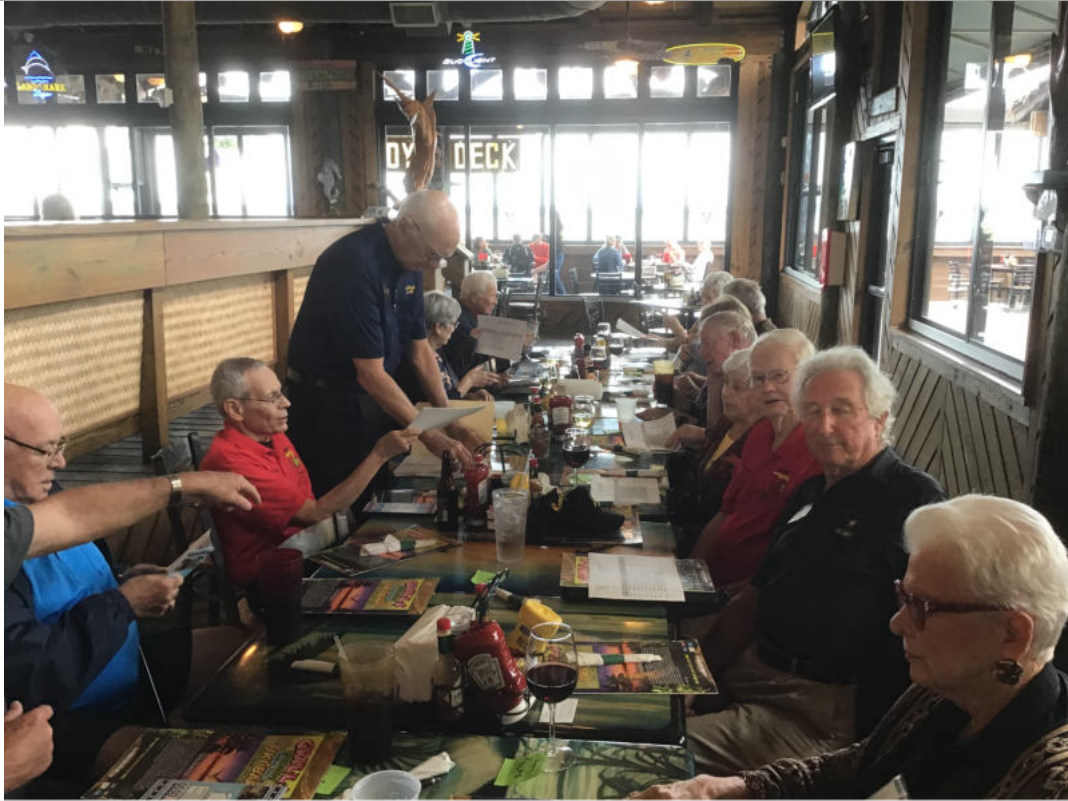
Grills - The long table!